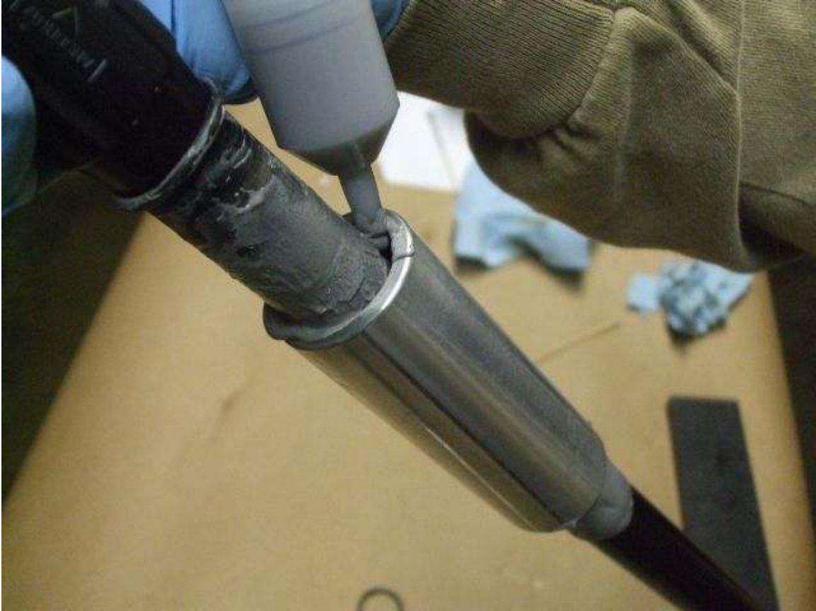
While sliding the sleeve into place use a syringe to fill in the gap between the barrel and sleeve