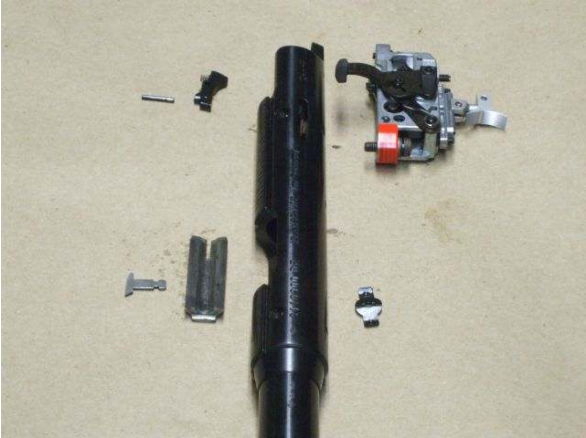
Remove the trigger, bolt stop, ejector and follower from the barreled action