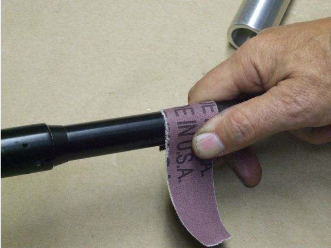
Sand the barrel where the epoxy will be applied and clean up with acetone